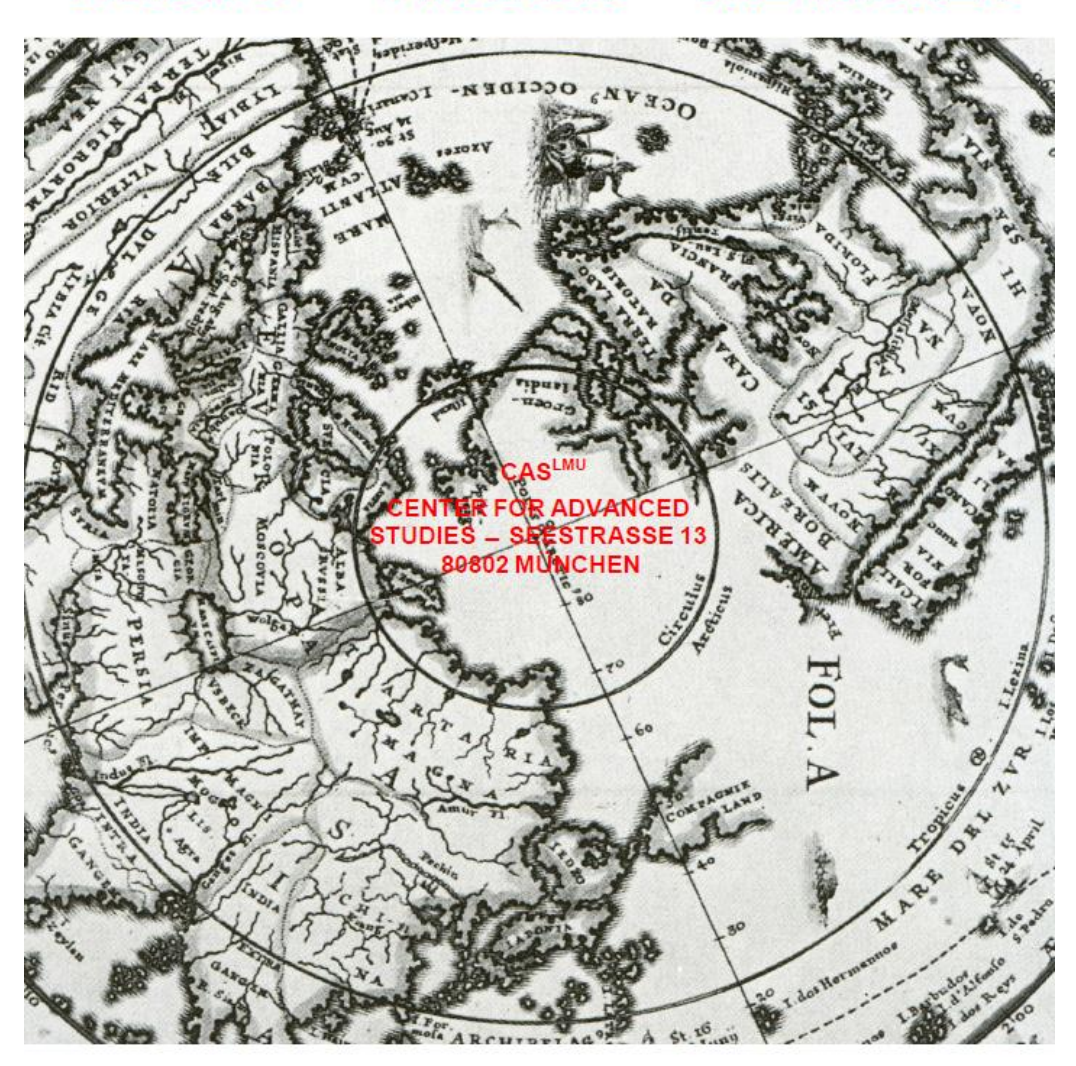
FRIDAY SATURDAY, JUNE 15 16, 2012